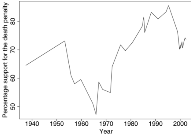
FIG. 1. The proportion of adults surveyed who answered yes in the Gallup Poll to the question, “Are you in favor of the death penalty for a person convicted of murder?” among those who expressed an opinion on the question. It would be interesting to estimate these trends in individual states.

that was conducted by Columbia University’s School of Social Work (Garfinkel and Meyers, 1999; Meyers and Teitler, 2001; Garfinkel et al., 2003). Both sets of surveys used random digit dialing.