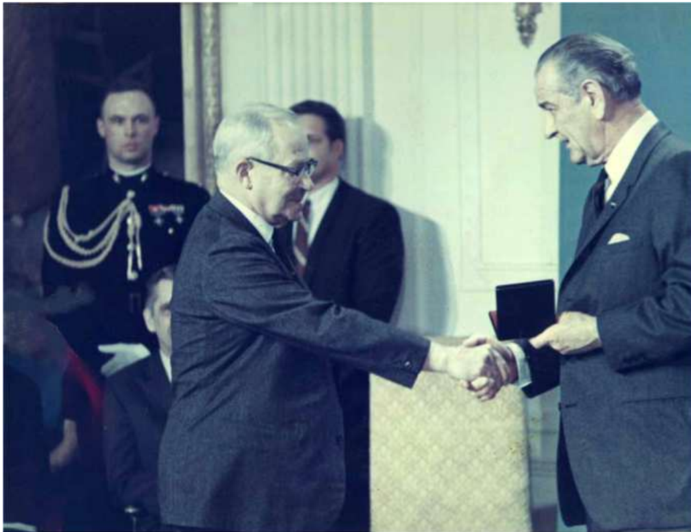
Fig. 3. J. Neyman, recipient of the National Medal of Science (1968), receiving the medal from President Lyndon Johnson at the White House ceremony on January 17, 1969.

In Neyman's case, he did both the applied and theoretical work. Neyman's monumental accomplishments did not happen by chance.