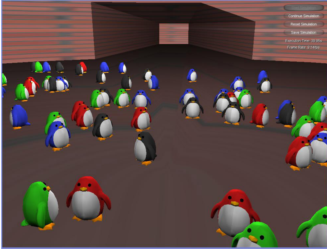
Figure 2: Driving and steering random SE (2) dynamics of 120 penguin-like robots (with embedded collision-detection). Compare with [2].

The dissipative crowd kinematics (23)-(24) obeys the set of n -tuple integral rules of motion that are similar (though slightly simpler) to the above rules of the car kinematics, including the following derived vector-fields: