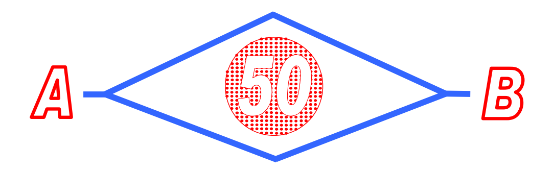
Figure 1: An electron is moving from point A to point B. In the middle of the figure we have a confined magnetic field of 50 Tesla.

(Alternatively A and B are the initials of Aharonov and Bohm and 50 is the time passed from the discovery of the effect till the year 2009)