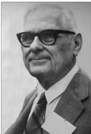
FIG. 7. Alonzo Church.

from that post because of failing vision and hearing. The family then moved to rural Virginia, where Alonzo Church and his younger brother grew up. He was an undergraduate at Princeton, graduating with an A.B. in mathematics, and then he continued as a graduate student, completing his Ph.D. there. Following a two-year post-doctoral National Research Fellowship, which he spent at Harvard University the first year, and the University of Gottingen and the University of Amsterdam the second year, he was invited to return to the Princeton Math Department, to begin his academic career there. He was a very important faculty member at Princeton for the next 39 years.