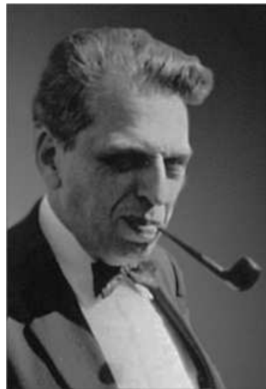
FIG. 2. Lipman Bers.