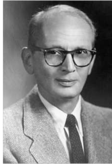
FIG. 6. Salomon Bochner.

Bochner was one of the foremost twentieth-century mathematicians whose research profoundly influenced the development of many different areas of analysis. He was born into a Jewish family in what was then a part of Austria-Hungary, and is now a part of