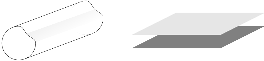
FIGURE 1. (a) n = 1, m = 2 ; (b) n = 2, m = 1

Throughout the paper we shall denote with x the group of the first n variables and with y the last m variables in \mathbb{R}^{n+m} . Waveguides appear in many concrete applications, since they can be used to model various interesting physical structures such as wires and plates (see Figure 1). The Laplace operator on \Omega with Dirichlet