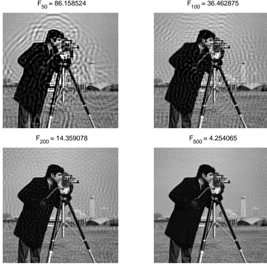
Figure 5.2: Iterations of the double smoothing algorithm

For a fixed k \geq 0 we consider for i = 1, \dots, n the function h_i : \mathbb{R} \rightarrow \mathbb{R} , h_i(z) = |z - b_i| + \frac{\mu}{2} \left( -\frac{(w_k)_i}{\mu} - z \right)^2 . For i = 1, \dots, n the optimal solution of the above problem is the projection of the unique global minimum (cf. [4, Proposition A.8 and Proposition B.10]) z_i of h_i on [0, \frac{1}{10}] . For i = 1, \dots, n we have