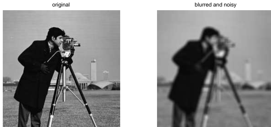
Figure 5.1: The 256 \times 256 cameraman test image

Thanks to the rotationally symmetric filter H , the linear operator A \in \mathbb{R}^{n \times n} given by the Matlab function imfilter is symmetric, too. Since each entry in B can be seen as a convex combination of elements in X with coefficients in H , we have A(S) \subseteq S . The norm \|A\|^2 is not explicitly given and is estimated by 1. After adding a zero-mean white Gaussian noise with standard deviation 10^{-4} , we obtain the blurred and noisy image b \in \mathbb{R}^n which is shown in Figure 5.1.