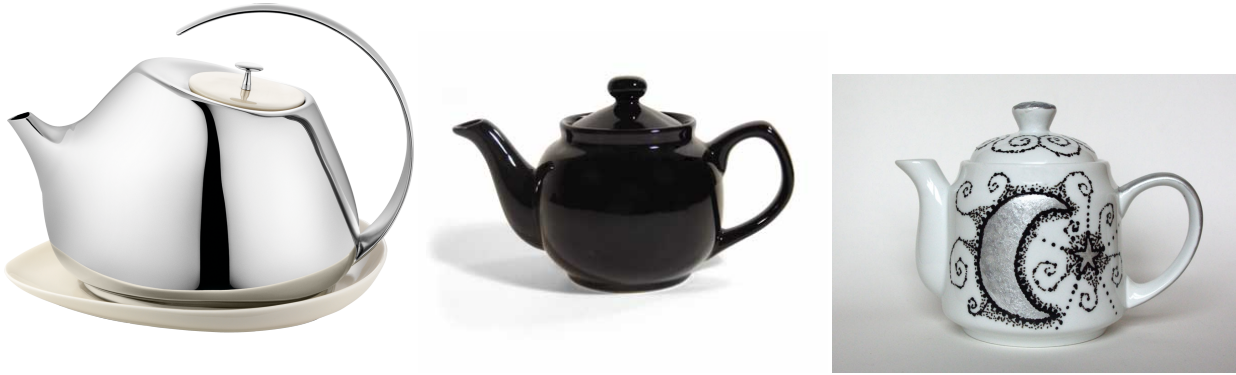
Figure 1. High resolution images of several possible types of HoHOs. Chocolate teapots are excluded as being insufficiently durable to have a significant lifetime in space (?).