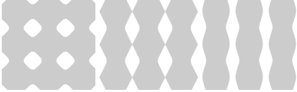
FIGURE 2. D_1^\omega , D_{\sqrt{\omega}}^\omega and D_\gamma^\omega for \gamma > \sqrt{\omega} .

and extend u_\gamma^\omega periodically both with respect to x and y . Then, by arguing as in Theorem 2.2, it is easy to see that