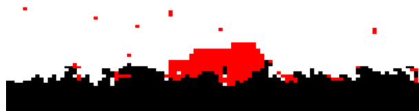
FIG. 1. (Color online) Snapshot of nucleation of a new phase (red) in a solution (white) in contact with a slowly dissolving surface (black). The snapshot is of a simulation in a box of 100 ( x axis) by 400 ( y axis) lattice sites, but it is cropped along the vertical axis. The dissolution rate r_D = 2 \times 10^{-6} , 2h/kT = 0.12 , and the snapshot is taken with the nucleus a little over the nucleation barrier.

The property P(t) is easily measurable in experiment, and this has been done for a number of crystallising systems [10–17]. For crystallisation, P(t) can be estimated