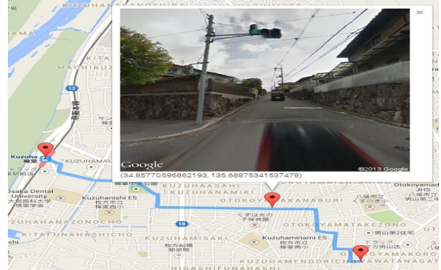
Figure 1: Steep Slope on the Route

steep slope on the route between a train station and a living community. For people who ride bicycles through this route, on one hand, if a user commutes to the train station from home by bicycle every weekdays, he may want to select more comfortable routes. On the other hand, if a user makes a cycling plan, he may prefer more difficult routes for fun. Both of them need additional environmental information on the routes and automatic route recommendations based on these environmental information.