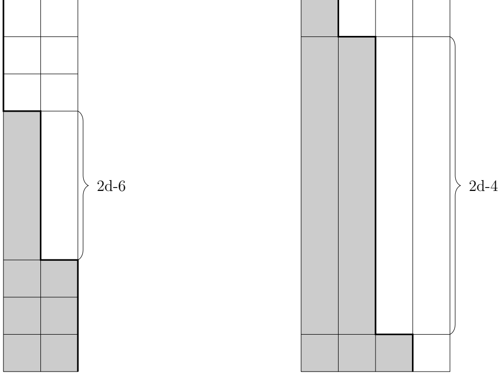
FIGURE 1. The partition on the right of 2d \times 2 blocks corresponds to T_1 , the partition on the left of (2d - 2) \times 4 blocks to T_2 .