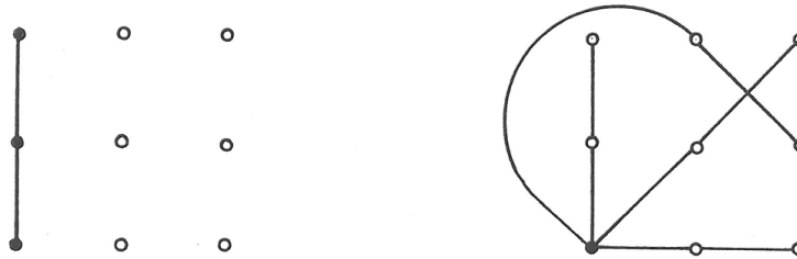
FIGURE 1. A finite plane is formed by the operators A_{ij} . To the left we illustrate the equation P_0^{(\infty)} = \frac{1}{3}(A_{00} + A_{01} + A_{02}) . To the right we illustrate the equation A_{00} = P_0^{(0)} + P_0^{(1)} + P_0^{(2)} + P_0^{(\infty)} - \mathbf{1} . Note that both the points and the lines in the affine plane correspond to points in Bloch space.