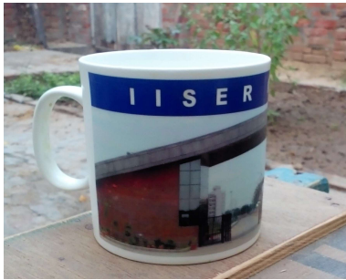
Figure 1: Hot tea cup.

From energetic point of view reverse (heating of tea) is perfectly possible in which energy is transferred from air molecules to tea molecules. Thus, from the