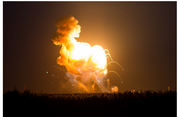
FIG. 1: Fireball associated with the failed Orb3 launch

In 2014, a field test to 35km using a high altitude weather balloon was used to test thermal, vacuum and vibration resilience simultaneously, in a space-like environment [2].