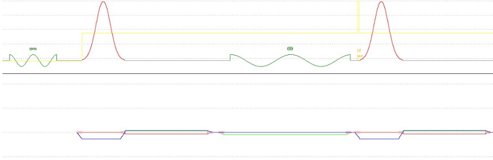
Figure 1: Conventional gradient echo imaging sequence.