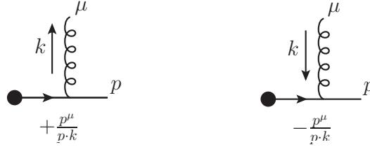
Figure 2: Eikonal Feynman rules for (anti)quark propagators.

where on-mass-shell condition is assumed ( p_a^2 = 0 ). Therefore one may deduce the following eikonal Feynman rules for a (anti)quark propagator: