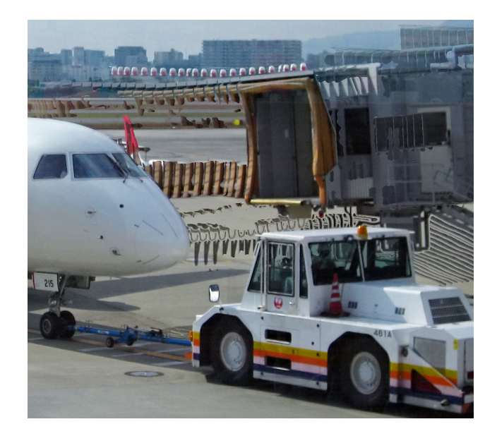
Fig. 6. Suddenly revealed pavement (a ghost) behind a retracting jet bridge, misclassified as foreground and thus partly covering the jet bridge's light brown motion trail.

ghost if it is near another object of similar compactness<sup>8</sup> and area, and its median color approximates that of its surroundings (itself subtracted from its dilation) better than that of the other object. This heuristic tries to distinguish an actual car from a car-shaped patch of pavement. If the surroundings' color is too varied (not grass, pavement, or sky), then the heuristic gives up and cannot accuse the object of being a ghost.