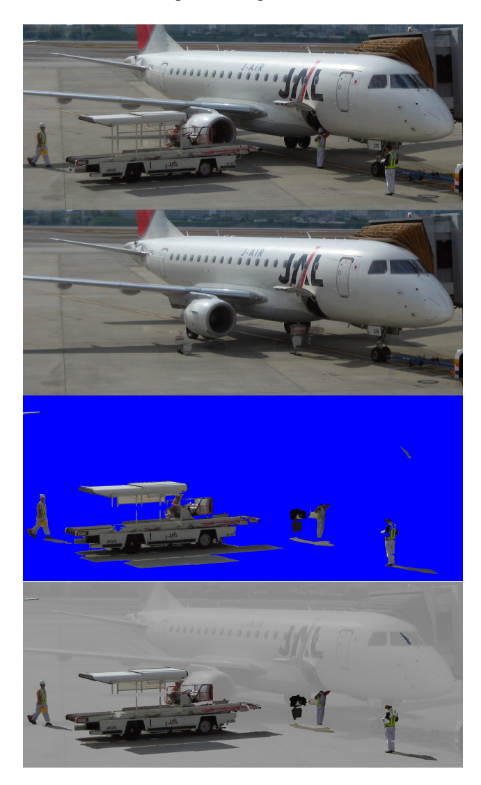
Fig. 4. (i) Deshaken image; (ii) background averaged from this image's neighbors; (iii) extracted foreground; (iv) recombined foreground and background.

moat, we reapply disk smoothing (section 4.1). This entire dilate-delete-smooth operation is then iterated, keeping track of the radius of the progressively larger smoothing disk, again stopping before oversmoothing. Finally, because near-hole removal very occasionally creates fresh small holes, one more hole removal operation is performed.