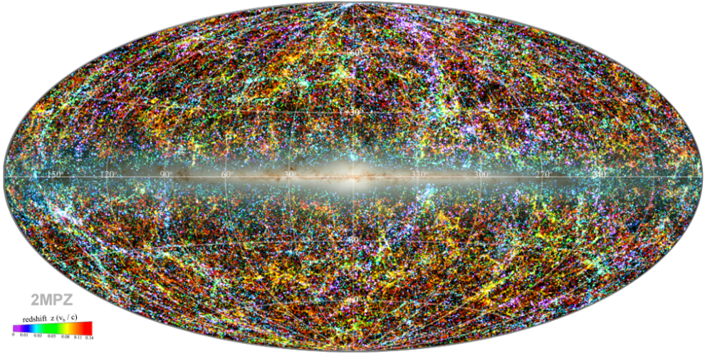
Fig. 1: Distribution of 2MPZ galaxies in Aitoff projection in Galactic coordinates, color-coded by photometric redshift.

Photometric Redshift sample (2MPZ) of almost 1 million galaxies covering most of the sky is publicly available 3 and is illustrated in Fig. 1.