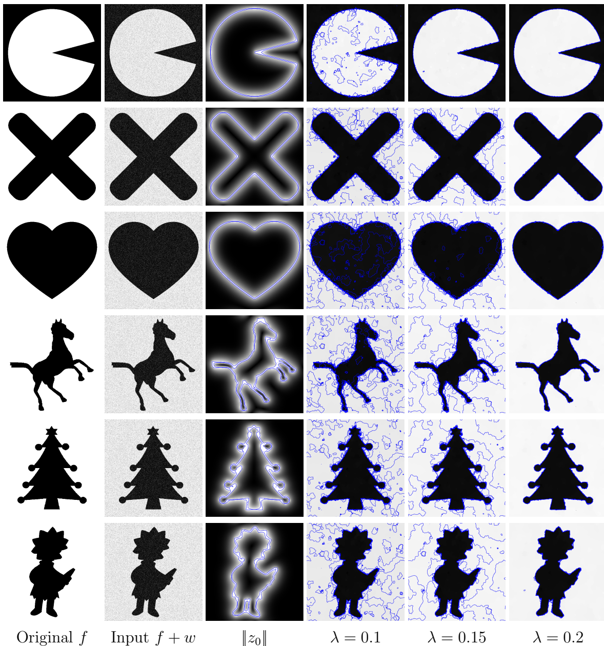
Figure 3: Display of the discretized solution u_\lambda of the discretized problem (\mathcal{P}_\lambda^d(y)) for several value of \lambda . The blue curves on top u_\lambda of indicate the level sets of u_\lambda (computed using bilinear interpolation on the grid). The blue curves on top of \|z_0\| indicate the obtained approximation of the boundary of the extended support \text{Ext}(Df) .