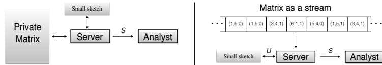
Figure 1: The central model (left) and the turnstile model (right).

Each update results in a change in the (i, j) -th entry of \mathbf{A} as follows: \mathbf{A}_{i,j} \leftarrow \mathbf{A}_{i,j} + \Delta . An algorithm is differentially private under turnstile update model if, for all possible matrices updated in the turnstile update model and runs of the algorithm, the output of the server