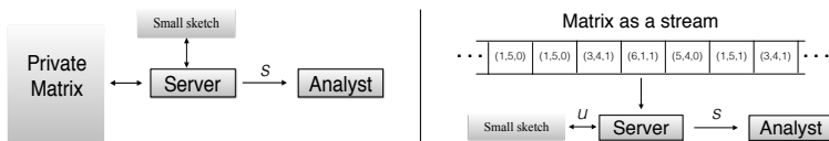
Figure 1: The central model (left) and the turnstile model (right).

Each update results in a change in the (i, j) -th entry of \mathbf{A} as follows: \mathbf{A}_{i,j} \leftarrow \mathbf{A}_{i,j} + \Delta . An algorithm is differentially private under turnstile update model if, for all possible matrices updated in the turnstile update model and runs of the algorithm, the output of the server