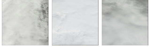
Figure 3. Examples of totally cloud-contaminated frames.

MC and RMC both require each image to have some pixels not corrupted by clouds to ensure successful low-rank matrix recovery [14, 29, 34]. Unfortunately, this is often not the case, as seen in Figure 3. Tropical regions for example can be completely covered by clouds as often as 90% of the time. Consequently, as we also show in the experiments below, directly applying MC or RMC will lead to significant information loss for the heavily contaminated frames. Table 1 summarizes the properties of the different approaches.