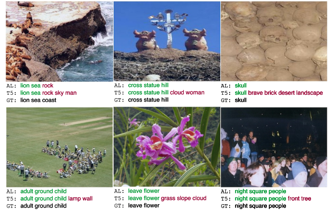
Fig. 1. Examples of results showing differences between Top-5 annotations and arbitrary length annotations. Top-5 annotations tend to generate more false positives (red). AL: arbitrary length, T5: Top-5, GT: ground truth.

Previous researches focus on learning the image-to-tag correlation as well as tag-to-tag correlation to improve the annotation performance. Although much progress has been made in the research community, most of the existing methods overlooked a fundamental philosophy of recognition: recognizing