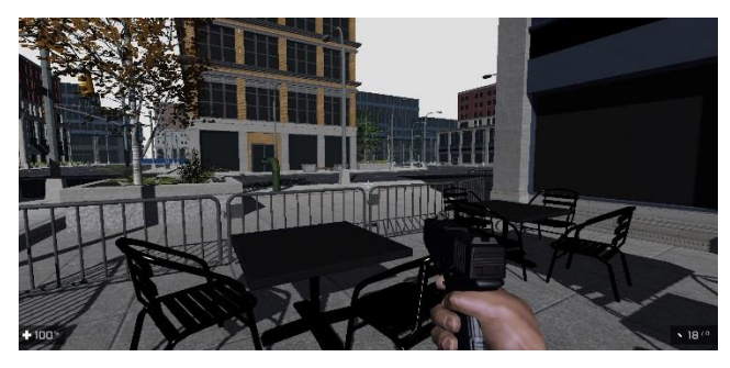
Figure 5. Placement of Props.

The chromosomes of the maps are represented as a strongly typed list where all parameters such as building height, type of content (building, street, free space) and position of props (leaves, containers, obstacles, fences, plants) are held as numerical values. The system is able to produce environments where props are well placed in context, as shown in Figure 5.