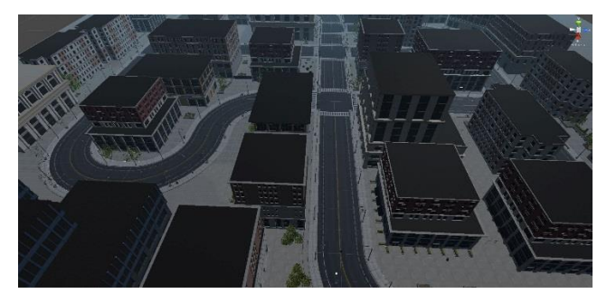
Figure 2. Game Level in Unity3D.

We present an Urban FPS Generator , which is a multi-agent evolutionary system that integrates human and computational agents into the selection process of a genetic algorithm. It is capable of addressing different aspects of Computational Creativity, and in its current version targets placement of game assets to form playable FPS maps. Figure 2 shows a typical game level in Unity3D developed with the approach.