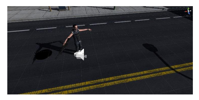
Figure 6. NPC Using Advanced AI.

dimensional space, whereas path finding is limited to simple two dimensional maps. Ray casting is conveniently part of the Unity3D physics engine. It is therefore efficient and simple to use. Overall ray casting is a mechanism that provides significant improvements over simple path finding and advances common AI techniques used for NPCs. Figure 6 demonstrates the use of these techniques.