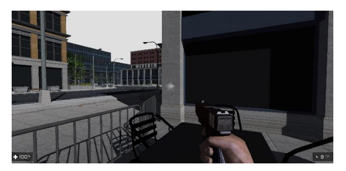
Figure 4. Fully Playable FPS Map.

The systems makes use of prefabs, which are prebuilt game assets inside the Unity3D project. Prefabs can be used as instances inside a game level (or scene). The current version of Urban FPS Generator uses 12 building prefabs, a range of street sections, a number of simple props such as chairs, tables, leaves, containers and plants, as well as 5 weapons from the UFPS package from the Unity3D asset store. This has allows the system to be suitably robust and have the ability to produce fully playable levels. One such level is shown in Figure 4.