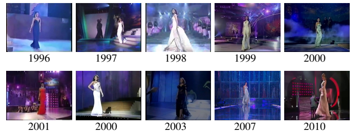
Fig. 2: Catwalk stages for all years

The MULR problem evaluation metric — In the MULR problem we are interested in evaluating how similar is the ranking determined to the scoring function f_l from the actual ranking of each year. To this end, we use the Normalized Discount Cumulative Gain (NDCG) proposed to measure ranking quality of documents [24], [30]. NDCG is often used to measure of the efficacy of web search algorithms [24].