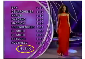
Fig. 3: Judges' scores. Left: from Wikipedia. Right: from the video.