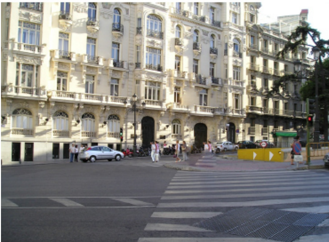
Fig. 3. More results on Image inpainting