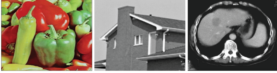
Figure 1: Original images

By comparing with the classical methods, phased based methods may show more detail on image.