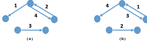
FIGURE 2. (a) Edge-labeled graph induced by disregarding vertex labels in Figure 1(a). (b) Edge-labeled graph induced by disregarding vertex labels in Figure 1(b). The graphs in (a) and (b) have equal probability under an edge exchangeable model.

a path (s_i, a_{i,1}, \dots, a_{i,k_i}, t_i) from source s_i to target t_i by passing through the intermediate nodes a_{i,1}, \dots, a_{i,k_i} , altogether indicating that the path traversed s to a_{i,1} to a_{i,2} and so on until passing from s_{i,k_1} to t_i . If \mathbf{X} was obtained, for example, by uniform random sampling of source-target pairs (s_i, t_i) and then by applying an algorithm, such as traceroute, to obtain a path between s_i and t_i , then the sequence of paths \mathbf{X} is exchangeable and, therefore, so is the induced path-labeled structure shown in Figure 3.