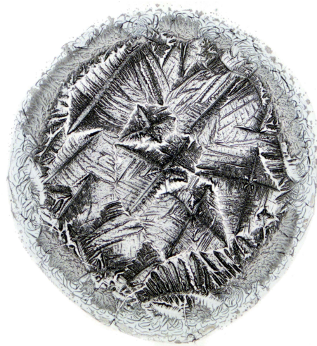
FIG. 2. Crystal patterns in a dried sample of albumin + NaCl.

If salts are present in the droplet, they usually crystallize during drying. Morphology of the salt crystals is very sensitive to the kind of salt, concentration and type of colloidal particles, as well as the rate of evaporation [54, 57, 58, 80, 84–87, 148, 149]. This sensitiveness allows using the morphology of salt crystals as an indicator, e.g. to diagnose different diseases from biological fluids [21, 120]. At the same time, this sensitivity impedes modelling because a lot of different effects have to be taken into account. In fact, all used models should be treated as semi-empirical. The models often utilize the lattice approach [58, 150–153] and diffusion equation [84, 154]. Adequacy of some models [150–152] has been questioned [154]. Mainly, dendritic crystal growth can be observed at the final stages of drop desiccation. Both non-equilibrium growth and presence of impurities may produce dendritic shape of crystals [155]; these effects can be reproduced in a simple model [156]. The phase-field method [157] looks extremely promising for modelling crystal growth in desiccated colloidal droplets with salt admixtures, but it requires a lot of additional information, which is difficult to obtain experimentally.