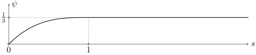
Figure 1: Graph of the function \psi .

where \chi_{[0,1]} denotes the characteristic function of the interval [0, 1] .