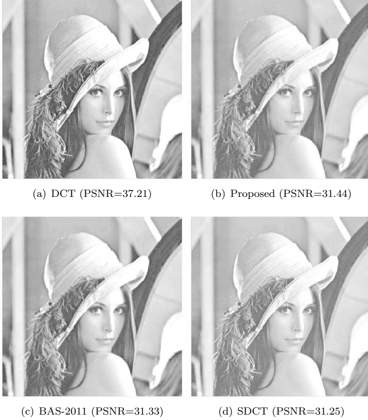
Figure 3: Compressed Lena image using (a) the DCT, (b) the proposed transform, (c) the BAS-2011 transform, and (d) the SDCT, for r = 25 .