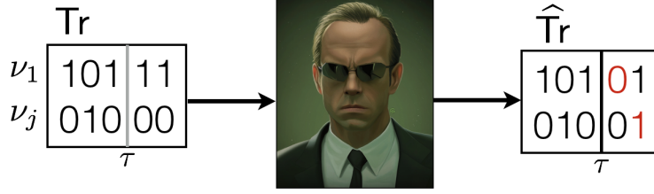
Figure 1: The Simulator acts as a man-in-the-middle between the original transcript and the transcript the algorithm receives. It leaves the transcript unchanged before some time \tau , but modifies it in arbitrary ways after this time. Red denotes the samples that were changed that reduced the distance between the instances. Note that all events defined on just the first \tau samples are truthful.