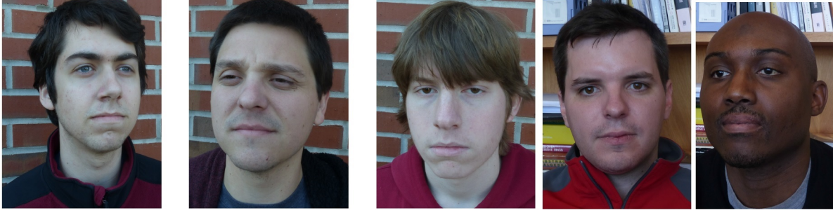
Figure 1: Faces used in the extrinsic MANOVA analysis

We will compare these faces by conducting a MANOVA on manifold to compare g = 5 VW-means on P\Sigma_3^7 = (\mathbb{R}P^3)^2 . For n = \sum_{a=1}^5 n_a = 31 where n_1 = n_2 = n_4 = n_5 = 6 and n_3 = 7 our hypothesis problem is