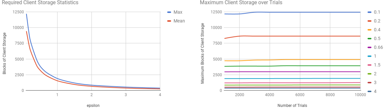
(a) Required client storage for CacheShuffleRoot.