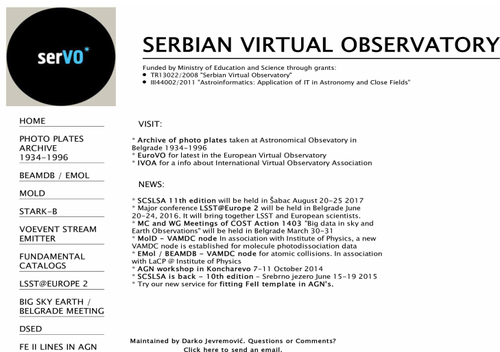
Figure 1. The home page of the SerVO (Jevremović et al. 2009).

Many fields in astronomy, atmospheric physics, chemistry, industry etc. depend on data for A&M interaction processes. A reliable exchange of such data has become crucial. In this context, we are developing the MOL-D database. MOL-D database is a collection of