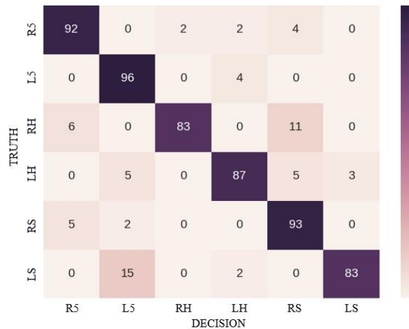
Figure 3. Gesture recognition confusion matrix for the 6 gestures retained (numbers reflect percent of true gestures).

incorporate a brief user-specific training session when installing the SqueezeBands system. A user-specific classifier is likely to have higher accuracy than a general classifier employed by our system. Second, two-thirds of the gestures (L5, R5, LH, RH) classified are dyadic in nature. For example, a handshake should only be classified as a handshake if the system is reasonably confident that both participants are attempting the same gesture. Thus, high confidence for one of the participants may make up for low confidence for the other participant in selecting the correct gesture. Overall, despite the initial promise shown by our preliminary gesture detection system, significant future work is necessary to demonstrate its effectiveness in the field.