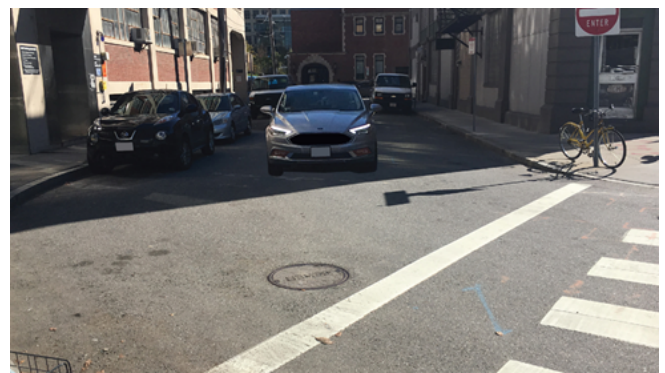
Figure 1: The driver was not visible in the base image used to create the designs due to lighting and reflection angles.

The base photograph used to create the stimuli (see Fig. 1) was of a late model passenger sedan on a one-way urban street approaching an uncontrolled intersection/crosswalk (no traffic light). Under the lighting conditions the driver is not visible.