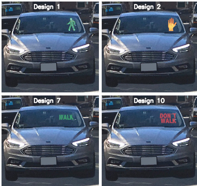
Figure 2: Four of the designs tested (out of 30 total in Fig. 3) shown in cropped, close-up views. Presentation to participants used the entire image shown in Fig. 1 at a 1280 pixels wide and 720 pixels tall resolution. These 4 designs performed significantly better than the other 26 at communicating their intent as shown in Fig. 4.

is provided as supplementary material. The size of the stimuli presented to each Turker was 1280 pixels wide and 720 pixels tall. Turkers with screen resolutions below this size were automatically detected and could not participate in the experiment.