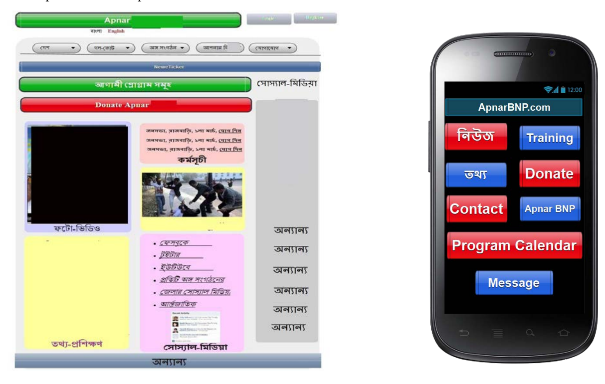
Figure 2. Web platform and mobile based application for a political party

The method of this technology is to extract relevant and interesting knowledge from big amount of data using data mining. Among several tasks of data mining classification [21] is one of the most useful techniques to build any model for decision making process from input data set. Then this model can be used to predict future data trends [22]. Hence, an application is developed for Android operating system as well as a web platform is also open for all citizens, supporters, stakeholders, party members etc. Two screen shots, as shown in Fig. 2, are presented here for the example of this development.