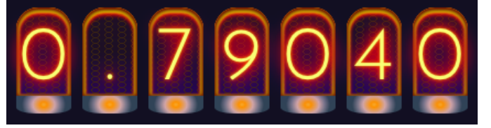
Fig. 3. This is Steins gate’s choice: \gamma = 0.79040 . For items having at least one rating, it is better to rely more on the ratings predicted by ALS than by LASSO.