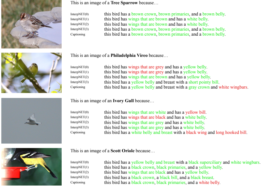
Figure 2: Example classifications and explanations. Green and red text signify a valid and invalid descriptor respectively.