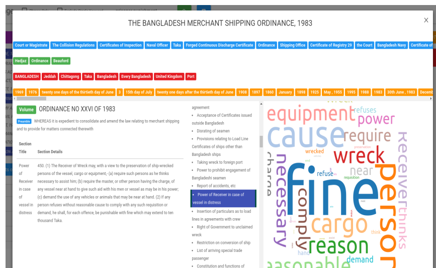
Figure 3: A law article’s named entities exploration.

Figure 3 shows the entity summary view. Organizations, locations, and any time related information in the article are shown as clickable tabs. Clicking a tab shows the sections where the tab entity occurs. Sections can be individually selected from the section list, and a word cloud allows the user to highlight section texts where these keywords occur.