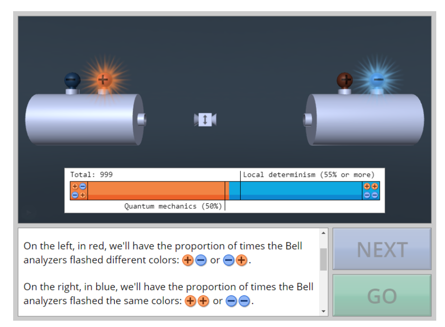
Fig. 3. Bell experiment using two "Bell analyzers" and a source of entangled atom pairs. Each Bell analyzer contains a three-positioned Stern-Gerlach analyzer and two detectors inside, as previously assembled in an earlier tutorial.

An important aspect of the probabilistic model for the simulations is that it allows us to visually emphasize the probabilistic nature of quantum mechanics. Experiments always consist of hundreds of consecutive trials until conclusions can be drawn from the results. They are displayed using intuitive visuals like color-coded proportional bar charts, which give an immediate intuition for probabilities between two events. As results start to accumulate, the student can almost "feel" the results converging to the predicted value, despite the random fluctuations. This greatly enhances the satisfaction of running the simulations, making them more concrete and tangible, as opposed to simply reporting the final result (see Fig. 3)