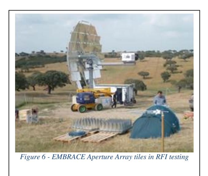
C. Commissioning and RFI testing : Demo Aperture Array tiles

The Bio-Stirling Power Plant was connected to the SKA Mid Frequency Aperture Array (MFAA) demonstrator and started working in simulated real conditions as the only electric supplier of the radio-astronomical system as a whole. MFAA tiles require a stringent steady state power supply, besides a good control of Radio Frequency Interference (RFI) levels, in agreement with SKA RFI standards. Deploying B4SKA technology in future to deliver energy to SKA telescopes results in tough RFI emission requirements on the energy generating equipment within a short distance to the SKA stations. For Assembly, Integration and Verification operations (AIV), ASTRON provided the demonstrator including 4 antennas tiles, 1 antenna beam former, protection huts and processing unit, electrical circuitry and control. ASTRON was also responsible for its assembly and integration, while IT and CSIC were responsible for the verification tasks (Figure 6).