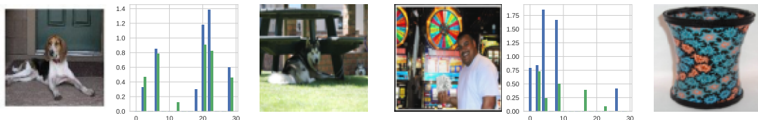
Figure 2: After sampling two datasets D \in \mathcal{D}_{\text{tr}} and D' \in \mathcal{D}'_{\text{test}} , we show on the left the two images x \in D , x' \in D' that minimize \|h(x, \lambda) - h(x', \lambda)\| and on the right the ones that maximize it. In between each of the two couples we compare a random subset of components of h(x, \lambda) (blue) and h(x', \lambda) (green).

Ongoing experiments aim at combining the first and the second design patterns outlined in Section 4 both in depth (lower layers weights are hyperparameters and higher layers weights initial points) and in width (a portion of filters constitutes the meta-representation, while the weights relative to the rest of filters are considered initialization), and at experimenting with the third pattern. Moreover we plan to explore settings in which different datasets come from various domains (e.g. visual, natural language, speech, etc.), are linked to diverse tasks (e.g. classification, localization, segmentation, generation and others) and have structurally different instance spaces.