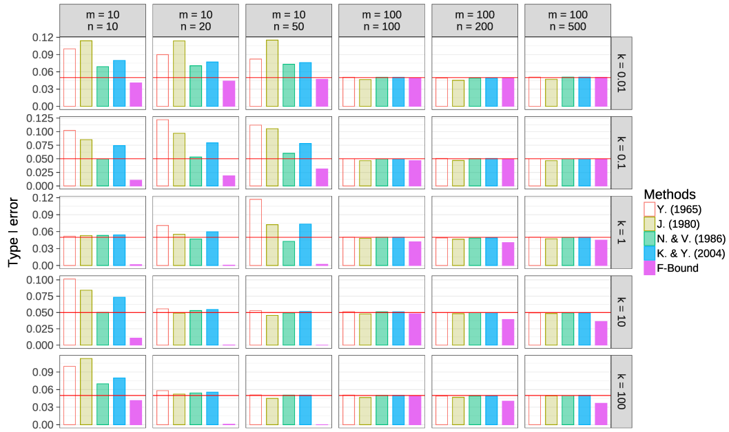
Figure 1: Type I errors of five testing methods for the multivariate Behrens–Fisher problem under different parameter settings, with each setting displayed in one sub-plot. The significance level is set to \alpha = 0.05 , indicated by the horizontal lines in each sub-plot, and the height of the bars stands for the Type I error. The first four methods are existing solutions to the problem, and the one labeled with “F-Bound” is the approach based on (7).