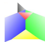
Figure 3. Spinfoam: the time evolution of a spin network.

In the covariant formalism (see [2]), transition amplitudes are defined order by order in a truncation on the number of degrees of freedom. At each order, a transition amplitude is determined by a spinfoam : a combinatorial structure \mathcal{C} defined by elementary faces joining on edges in turn joining on vertices (in turn, labeled by quantum numbers on faces and edges), as in Figure 3.