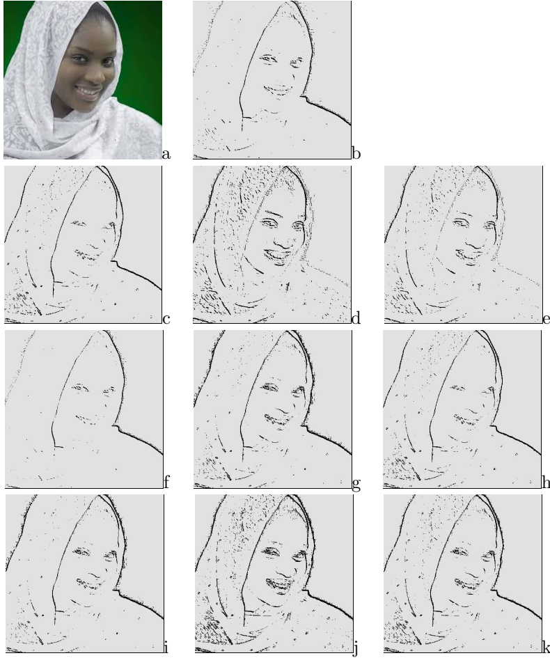
Fig 1: Results facial image segmentation

In this part of the work we will make a brief presentation of the classification of an image. A presentation of the transformation with the corresponding divergence and the optimal threshold. The color image segmentation results is that : (a) corresponds to the original image , (b) image D_{ABS}^{(1,0)} -divergence with k=2.4 , (c) image D_{ABS}^{(1,1)} -divergence with k=1354 , (d) image D_{ABS}^{(1/2,-1)} -divergence and k=2.5 , (e) image D_{ABS}^{(1/2,-1)} -divergence with k=3.4 , (f) image D_{ABS}^{(1,0)} -divergence with k=3.5 , (g) image D_{ABS}^{(1/2,1/2)} -divergence with k=4.5 , (h) image D_{ABS}^{(1,1)} -divergence with k=1350 , (c) image D_{ABS}^{(1,1)} -divergence with k=1354 , (i) image D_{ABS}^{(1/2,1/2)} -divergence with k=5.5 , (j) image D_{ABS}^{(1/2,1)} -divergence with k=50 , (k) image D_{ABS}^{(1/2,1)} -divergence with k=80 .