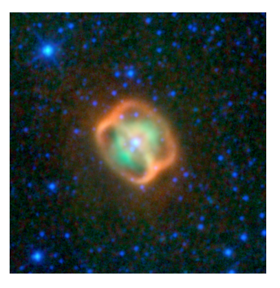
Figure 1.4 A colour composite image of the infrared emission from PN NGC 1514 highlighting the prominent rings, believed to represent the ends of a bipolar, hourglass-like structure - typical of the influence of a central binary star.

but which failed to find periodicities (e.g. De Marco et al., 2004), is strongly indicative of a large number of long-period binary CSPNe which have, to date, evaded detection.