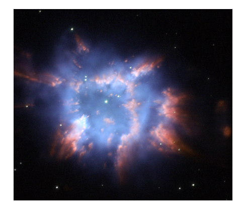
Figure 1.3 A colour composite image of PN NGC 6326 highlighting the filamentary structures found by Miszalski et al. (2009b) to be typical of central star binarity (Miszalski et al., 2011b).