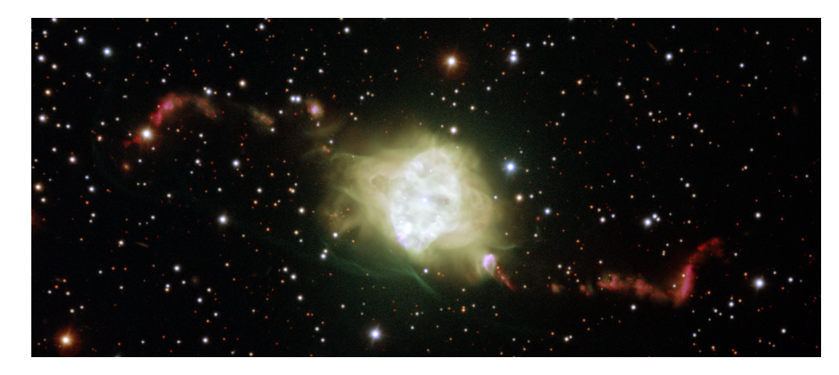
Figure 1.2 A colour composite image of PN Fleming 1 showing its remarkable pair of precessing jets, which are thought to have been produced by an intense episode of mass transfer just prior to the CSPN entering the CE phase (Boffin et al., 2012).

structures (see figures 1.2 and 1.3). Equatorial torii (e.g. Abell 41, Jones et al., 2010) and knotty waists (e.g. The Necklace, Corradi et al., 2011) can clearly be explained under the same prescription as the bipolar structures, if the amount of CE material deposited in the orbital plane is sufficiently high (knots can arise from the interaction of a photo-ionising wind with an inhomogeneous, clumpy torus; Miszalski et al., 2009b). Similarly, jets are a natural result of mass transfer between the binary components, and while most hydrodynamical models predict that accretion onto the secondary is minimal during the CE (Ricker and Taam, 2012; MacLeod and Ramirez-Ruiz, 2015) there is now growing evidence that a significant amount of material might be accreted before entering into the CE (see section 1.2.4). Low-ionisation filaments not aligned in either the polar or equatorial directions, such as those of NGC 6326 (see figure 1.3 and Miszalski et al., 2011b), are perhaps more difficult to understand, but are thought to form through a wind-shell interaction whereby modest inhomogeneities in the shell (which would, in these systems, be the ejected CE) are enhanced by the influence of an encroaching fast, low-density wind (Steffen et al., 2013).