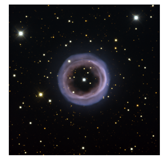
Figure 1.1 A colour composite image of PN Shapley 1. Upon first inspection, the PN appears to present a roughly spherical structure but is, in fact, a near-pole-on bipolar, the inclination of which is consistent with that of its central binary star (Jones et al., 2012; Hillwig et al., 2016b).

nary CSPNe with solid period determinations is a little over fifty, with all those systems being listed in table 1.1 (with a more detailed version continually maintained by the author at http://drdjones.net/bCSPN ).