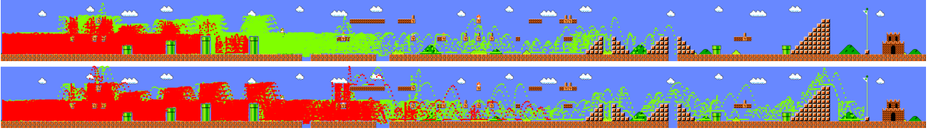
Figure 3. Binary visitation masks after 2M steps for Super Mario Bros. (All-Stars) level 1. Top: Random walk (red) compared against Q-map random goal walk (green). Bottom: DQN \epsilon -greedy (red) compared with Q-map DQN (green).