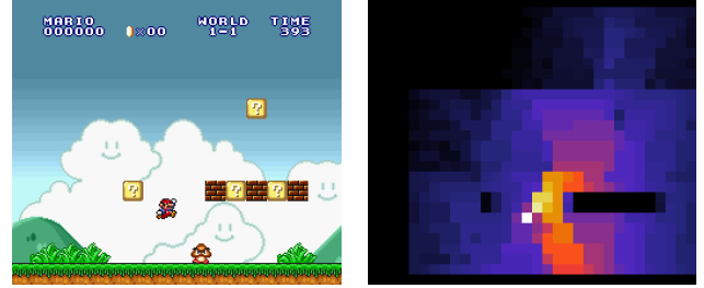
Figure 1. Discovering how to navigate Super Mario Bros. (All Stars) by reaching random screen coordinates. Left: a capture of the screen. Right: a ground-truth Q-map frame showing the expected distance to screen coordinates.

However, if rewards are sparse or are not sufficiently informative to allow performance improvements, \epsilon -greedy fails to explore sufficiently far. Several methods have been described that bias the agent's actions towards novelty mostly by using optimistic initialization or curiosity signals (Oudeyer et al., 2007; Oudeyer & Kaplan, 2009; Schmidhu-