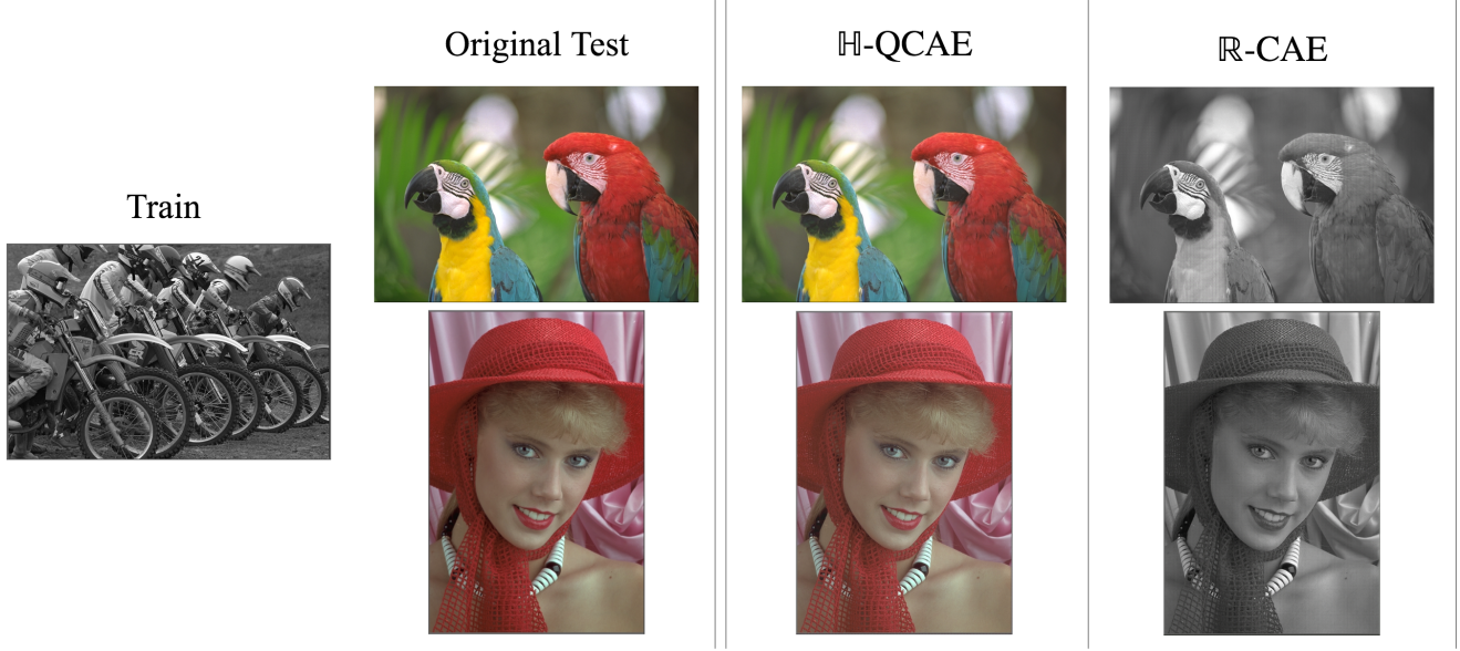
Fig. 2. Results on the gray-scale to color task with the KODAK data-set. A gray-scale training picture ( Train ) and two coloured original test images ( Original Test ) are randomly selected on the KODAK data-set and reproduced by both QCAE and CAE.

obtained with the CAE for the parrots and women images respectively. Nonetheless, while PSNR measures the amount of noise contained in an image, SSIM reports the structural and visual correlation of two pictures. SSIM of 0.96 and 0.93 are reported for QCAE compared to 0.87 and 0.86 for the CAE on the parrots and women images respectively. QCAE offered a better reconstructed image quality in both PSNR and SSIM metrics, even considering the inability of CAE to learn the color space. Moreover, the QCAE is composed of 6.4K parameters compared to 25K for the CAE. It is easily explained by the quaternion algebra. In the case of a dense layer with 1,024 input values and 1,024 hidden units, a real-valued model will have 1,024^2 \approx 1\text{M} parameters, while to maintain equal input and output nodes (1,024) the quaternion equivalent has 256 quaternions inputs and 256 quaternion-valued hidden units. Therefore the number of parameters for the quaternion model is 256^2 \times 4 \approx 0.26\text{M} .